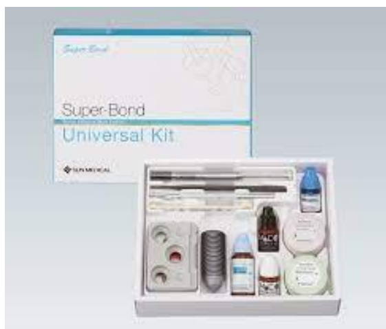
Image: Super-Bond™, now set to be sold in Brazil (actual product will differ from image.)

Employing 4-methacryloxyethyl trimellitate anhydride (4-META) as a dispersion-aiding monomer and tributylborane (TBB) as a polymerization initiator, Super-Bond™ is an acrylic resin cement made for use as a dental adhesive. It is referred to in academic literature as a 4-META/MMA-TBB resin. SUN MEDICAL began producing and selling the product in 1982, and since sales first began in Japan, the material has become a favorite among dentists due to its excellent adhesive properties and ample track record of effectiveness. Super-Bond™ finds use in a wide range of applications, including stabilizing mobile teeth, forming direct resin-bonded bridges, and enabling the adhesion of brackets and ceramic prostheses. The material enjoys widespread use in clinical settings around the world, with exports already going out to the U.S., Europe, China and South Korea.