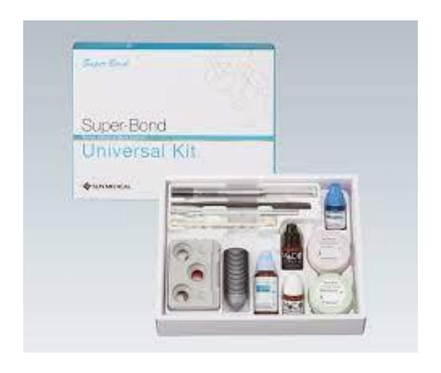
Image: Super-Bond™, now set to be sold in Brazil (actual product will differ from image.)

Employing 4-methacryloxyethyl trimellitate anhydride (4-META) as a dispersion-aiding monomer and tributylborane (TBB) as a polymerization initiator, Super-Bond™ is an acrylic resin cement made for use as a dental adhesive. It is referred to in academic literature as a 4-META/MMA-TBB resin. SUN MEDICAL began producing and selling the product in 1982, and since sales first began in Japan, the material has become a favorite among dentists due to its excellent adhesive properties and ample track record of effectiveness. Super-Bond™ finds use in a wide range of applications, including stabilizing mobile teeth, forming direct resin-bonded bridges, and enabling the adhesion of brackets and ceramic prostheses. The material enjoys widespread use in clinical settings around the world, with exports already going out to the U.S., Europe, China and South Korea.