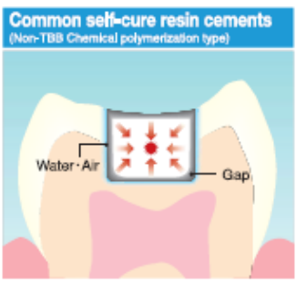
Since the polymerization proceeds from the inside of resin which has no air or water, the gap easily occurs between the tooth and the posin.

Super-Bond™ recently received pharmaceutical approval in Brazil, where the dentistry market looks set for growth going forward. This then prompted the decision to begin sales in this market, helping those in the country to keep their natural teeth for longer. Starting with an exhibition at CIOCE 2023 – an international dentistry conference set to be held in Fortaleza over May 6–9, 2023 – efforts will be made to gradually introduce the product across the country via KOL marketing at seminars and other such venues.